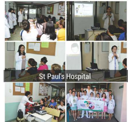
St Paul's Hospital