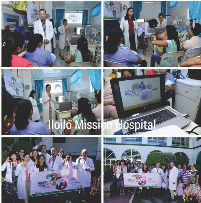
Iloilo Mission Hospital