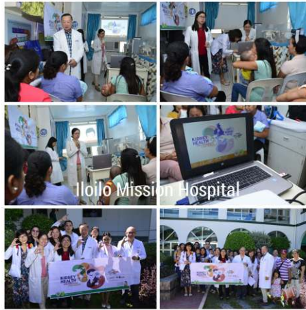
Iloilo Mission Hospital