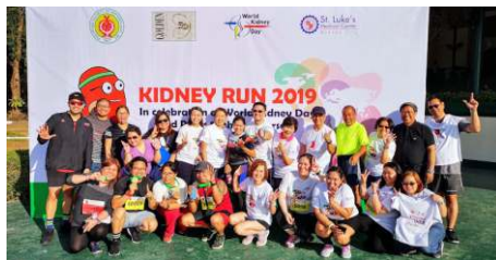
The Organizing Committee of the Kidney Run 2019