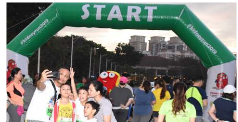
Kidney Health for Everyone, Everywhere! Kidney Health for the whole Family!