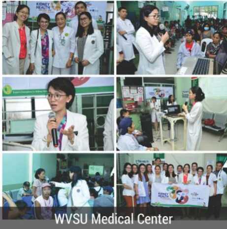
WVSU Medical Center