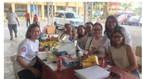
Lay forum with free urinalysis at Quirino High School