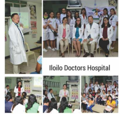
Iloilo Doctors Hospital