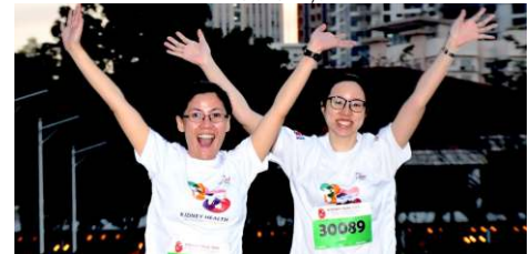
Nephrology Fellows in training crossing the finish line